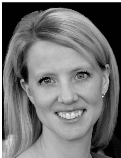
The New Mexico Musician – Spring 2018 Choral Section