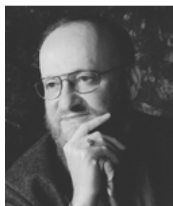
2013 All-State Band Clinics