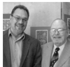
Mexico Public Education Department. He has served as general music vice-president,